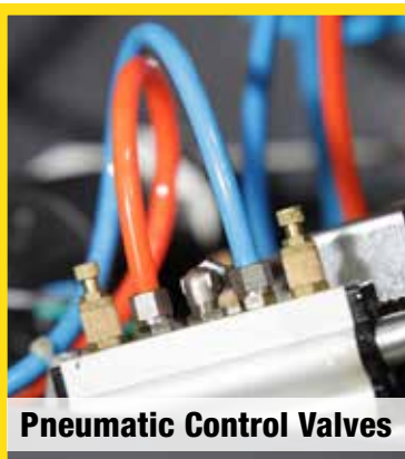
Pneumatic Control Valves

All moving parts feature maintenance-free linear guide bearings for easy adjustment of both vertical and horizontal wheel settings. The non-flex horizontal arm also features a hardened lower roller guide for smooth and controlled in-and-out movement. Integrated rubber bump-stops ensure smooth return during tilt-back operations to help reduce shock loading and minimize wear on tower guides and moving parts.