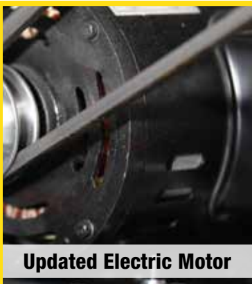
Updated Electric Motor

A maintenance-free gearbox features a large oil and grease reservoir that helps provide efficient heat dissipation and improved lubrication for longer service life. Internal baffles and a constant-seating stress flange gasket ensure positive, leak-free venting. The rugged gearbox enclosure is precision-milled for precise alignment of horizontal and vertical bases and features precision helical gears that operate much more smoothly and quietly than typical spur gear transmissions. The rugged housing provides maximum strength for extreme durability under hard working conditions and greater precision under load during worm and gear alignment.