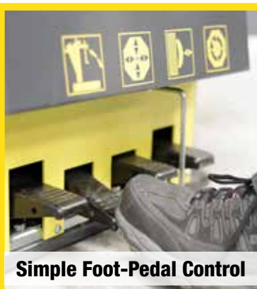
Simple Foot-Pedal Control

Industrial-grade, 45-micron pneumatic control valves feature die cast and machined bodies constructed from zinc and aluminum. High-performance polyurethane seals and self-lubricating, Teflon® piston guides provide increased service life and performance at the highest level possible within almost every imaginable working condition. Valve plungers feature muffled extrication ports that direct any dirt or contamination accumulated on the outside perimeter of the spool to be automatically blown away each time the valve goes into the release position.