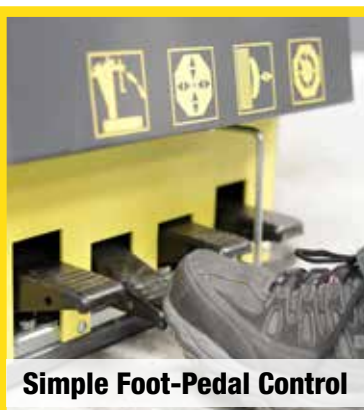
Simple Foot-Pedal Control

Industrial-grade, 45-micron pneumatic control valves feature die cast and machined bodies constructed from zinc and aluminum. High-performance polyurethane seals and self-lubricating, Teflon® piston guides provide increased service life and performance at the highest level possible within almost every imaginable working condition. Valve plungers feature muffled extrication ports that direct any dirt or contamination accumulated on the outside perimeter of the spool to be automatically blown away each time the valve goes into the release position.