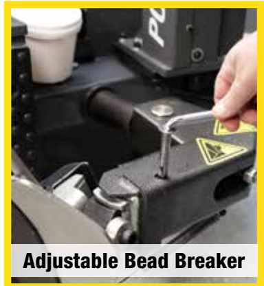
Adjustable Bead Breaker