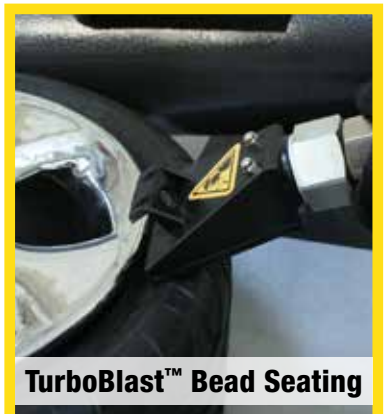
TurboBlast™ Bead Seating