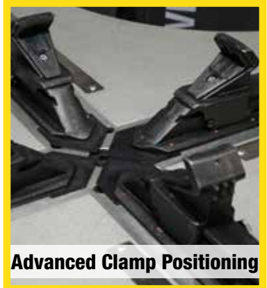
Advanced Clamp Positioning