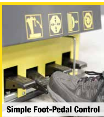
Simple Foot-Pedal Control

Industrial-grade, 45-micron pneumatic control valves feature die cast and machined bodies constructed from zinc and aluminum. High-performance polyurethane seals and self-lubricating, Teflon® piston guides provide increased service life and performance at the highest level possible within almost every imaginable working condition. Valve plungers feature muffled extrication ports that direct any dirt or contamination accumulated on the outside perimeter of the spool to be automatically blown away each time the valve goes into the release position.